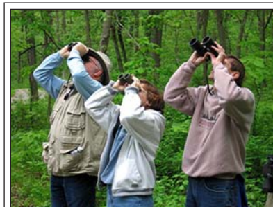
Spring migration this year was as good as I have seen it for 15 years.

I moved to Missouri in 1992 and was greeted by a great Spring migration season. The next year was very good as well. It has taken until this year to have that kind of wonderful spring birding again. During the early part of May our weather patterns set up just right to keep migrating birds here for a few days giving birders great opportunities to get out and enjoy themselves. For our birding groups, we had outstanding days pretty much everywhere we went. Watkin's Mill State Park, Weston Bend State Park and possibly the best day of them all at the Martha Lafite Thompson Nature Sanctuary in Liberty. If you were not, I wish you could have been with us!