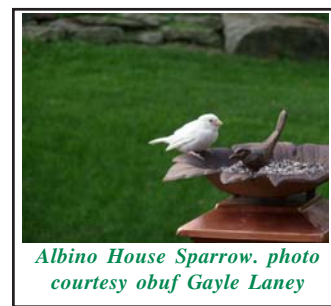
Albino House Sparrow.

A. As the photo here shows, we do see albino birds of various species from time to time in our area. Because albinism is a rare genetic trick that happens in wildlife (and humans) we tend to see it in the more common species. The greater the number of birds, the greater the chance for rarities to show up. I have seen albino robins, grackles, House Sparrows and, much to my surprise one day, a Ruby-throated Hummingbird. Even more frequently than pure albinos, we often see partial albinos. Albinism can be limited to just a couple of feathers or large patches like the entire head or wing. The first time I saw this was in college when our class saw a Boat-tailed Grackle with one white wing. Unfortunately, albinism isn't a successful path to a long life for birds. Predators often find these individuals more easily as they do tend to stick out in crowd.