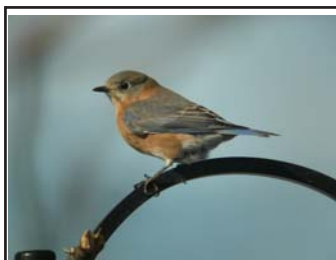
Eastern Bluebirds heavily depend on fruit to survive our winters.