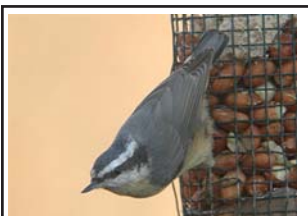
Red-breasted Nuthatches are one of the "cutist" birds you will attract to your feeders. They love peanuts, sunflower hearts and chips

Take 20% OFF a 20lb Bag of Wild Delight Deck, Porch & Patio®