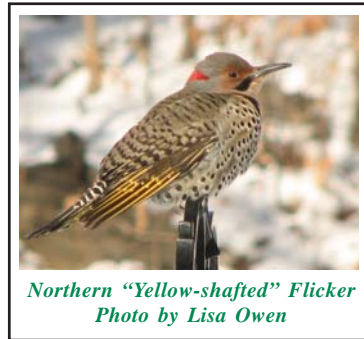
Northern "Yellow-shafted" Flicker

spotted breast. It is when they fly that they are really flashy. The large white rump patch and bright yellow color of the underwing and tail feathers are hard to miss. The black "moustache" line is only present on males.