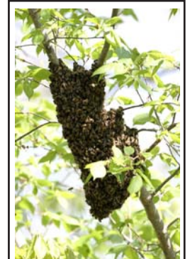
Honey Bee swarm where it belongs... in the woods.

The battle with bees and nectar feeders has been raging for years. With a little patience and creativity, it can be won.