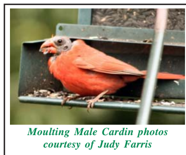
Moulting Male Cardin

A. The short answer is yes. While experts aren't exactly sure why this happens, they do believe it is rarely harmful. Most believe that it is a part of the natural molting process that for some reason in a few individuals goes a little wrong and they lose all of their head feathers at once instead of the typical "few at a time" pattern. Because it occurs in late summer and early fall weather is not a factor. In some cases, the feather loss can be caused by a lice or mite infestation. In both cases, feather growth is seen rather quickly and the birds seem to do just fine.