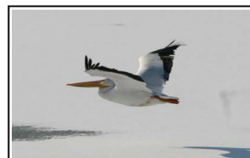
American White Pelican

Meet at the store at 7:30 or the refuge at 9:00. Cost $5 per person.