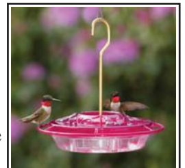
Aspects' Hummzinger Small Fancy Fuschia