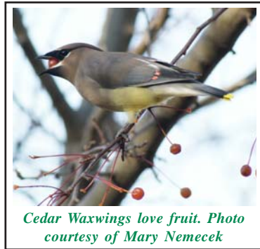
Cedar Waxwings love fruit.

When the shortening days of late summer give way to fall, most people notice a substantial decline in activity at their feeders. Mother Nature provides a bounty that lures the birds from the feeders to something more tempting. Ripening berries abound and one way to keep the birds in your yard is to grow some of the preferred berry-bearing natives. They have excellent wildlife value and are attractive in the landscape as well. In addition, birds that are not normal yard visitors may show up for the fruit feast. Keep a close eye and you may see waxwings, warblers, vireos, thrushes, bluebirds and kingbirds among many others. Many of these native plants provide cover and nesting sites for birds throughout the spring and summer. All of the following are native to Missouri.