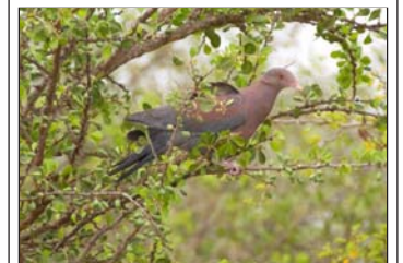
Not your city variety of pigeon! This is a Red-billed Pigeon, which is native to Mexico. While you can find them along the Rio Grande River, you generally only get glimpses of flying birds. We really got lucky this April!