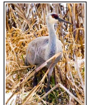
Sandhill Crane

This trip completely depends on the recovery of the refuge after the water's retreat. It could leave great shorebird and waterfowl habitat or it may take a couple of years to recover. Make sure you register so we can call the week or so before to let you know if this trip will still go. Meet at the store at 7:00 or the refuge at 9:00. Cost $5 per person.