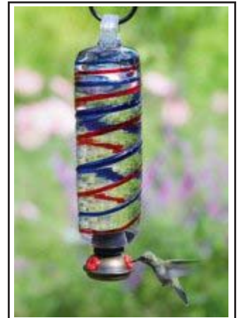
Colorful feeders, like this one from Par-a-sol, attract hummers as well as other all red feeders.

A. It is definitely true. The Missouri Department of Conservation recommends that you do not intentionally feed critters such as raccoon and deer. There are many reasons but the picture here should illustrate the point well. One little masked bandit is cute but 17 are nothing but trouble. What do they do when the free food runs out? Trash cans, dog bowls, grill covers, anything that smell remotely like food is fair game. On top of all that, don't forget that raccoons can carry rabies and distemper. Raccoon baffles from ERVA are super effective at keeping these rascals from climbing your feeder poles.