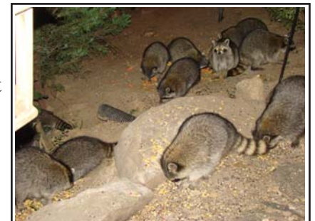
How many can you count? Feed one, feed them all. Don't let this become your backyard.