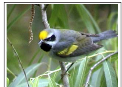
Beautiful songbirds such as this Golden-winged Warbler are on the RED list of Birds of Conservation Concern. They are targets for protection by ABC.

Like everyone featured in this column, ABC is a private, nonprofit that counts on donations to support all that they do. Please consider sending something to help them out.