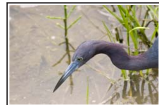
The stunning Little Blue Heron are always a treat to find.

Meet at the store at 1:00 p.m. Cost: $3 per person