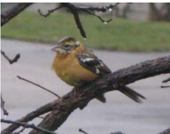
This young Black-headed Grosbeak was a quite rare addition to one of our customer’s feeder watch list!