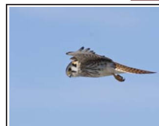
American Kestrels are most commonly seen hovering over highway medians in late fall and early winter.

❖ The hikes and programs listed below fill on a first come first serve basis. PLEASE call the store to register (816) 746-1113