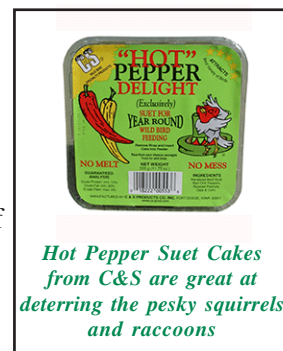
Hot Pepper Suet Cakes from C&S are great at deterring the pesky squirrels and raccoons

A. Luckily, squirrels don't tend to take to suet as often as they do sunflower but we do get the occasional report. The real problem tends to be with the "night shift". Many people simply take their suet feeders in at night. While this very effective, it only takes forgetting it once that leads to a trip down to the edge of the woods to retrieve the feeder. The simplest solution that I have found is Hot Pepper Suet. No, it doesn't hurt the birds and they will eat it just as well as many of the other formulas. Mammals have very different taste systems from birds and are quite sensitive to the peppers. They will leave it alone. Some do like to rotate the Hot Pepper with their favorite cake. If you do want to do this, remember to wear gloves while handling the pepper cakes.