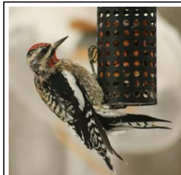
Male Yellow-bellied Sapsucker

Though the name doesn't say it, they are woodpeckers. They are among a group of birds who are known for drilling rows of small holes into living trees so that the sap "oozes" to the surface. The sapsucker and other birds will lick the sap for the sugar energy but they will feast on the insects that are attracted to it. I have seen Ruby-throated Hummingbirds licking the sap in the early spring. Contrary to popular belief, the sapsucker holes