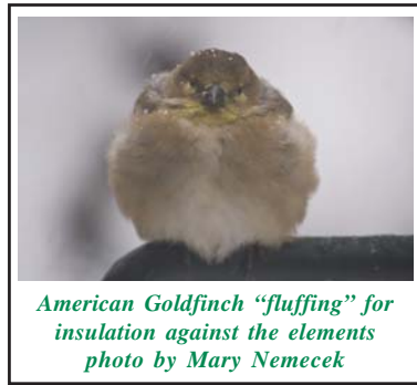
American Goldfinch "fluffing" for insulation against the elements

can fluff up. Let us not forget what the source of insulation is for a down jacket. By fluffing up and creating air space between feathers as well as feathers and skin, it is like putting on an extra jacket. This is why you will hear me talk about