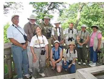
Weston Bend Birders at the Missouri River Overlook

I know if you are a regular reader, you know I talk about birding at Weston Bend a lot. I don't think I have ever explained how important that area is for our birds. When you look at the Missouri river from Kansas City to St. Joseph, the land is quite open and flat. If you can imagine yourself a small bird flying from Central America to Northern Canada each spring, your life depends on places that you can take time to safely find lots of food and clean water. By far the most lush tract of forest along your important travelway is the area on both sides of the river near Weston/Leavenworth. The combined areas of land protected by Ft. Leavenworth and the Missouri Department of Natural Resources is beautiful. Weston Bend is a fairly young park. It was established in 1980 and protects 1,180 acres of habitat and has several wonderful trails and an overlook platform that shouldn't be missed. Located on 45 Hwy just south of Weston, I recommend visiting this and many other of our fine state parks often.