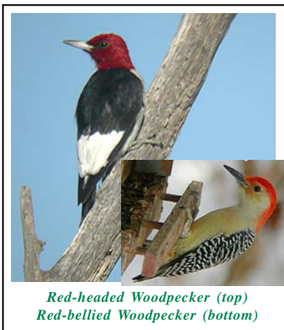
Red-headed Woodpecker (top) Red-bellied Woodpecker (bottom)

Depending on food supply and weather severity, Red-headed Woodpeckers may be seen in our area year-round. Unfortunately, Red-headed Woodpecker populations have declined severely due to increased nest site competition from European starlings and from removal of dead trees.