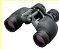
Nikon Superior E 8X32 - voted the Best Birding Binocular in the world by www.betterviewdesired.com for the past 10+ years. Amazing clarity and color, wide field of view, just incredible optics for the price. They have been $699.99 for years, I have 3 pair available for $560.00.