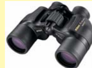
Nikon Action 8X40 (Clamshell) - our best selling binoculars which normally sell for $69.99 Sale Priced at $52.99