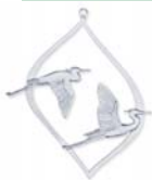
Beautiful Pewter Ornaments from Amos Pewter