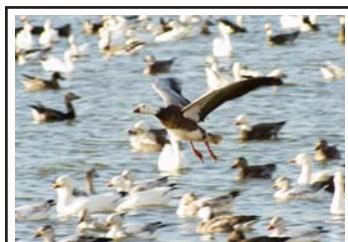
"Blue Goose" form of the Snow Goose at Lewis & Clark State Park

Last winter, Lewis & Clark State Park was loaded with Snow Geese and Bald Eagles. We will search area hotspots for hawks, eagles, Snow Buntings, Lapland Longspurs, Short-eared Owls and any other goodies. Dress warmly and you may want to bring a thermos of something hot.