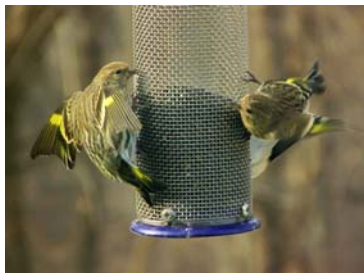
Project FeederWatch helped scientists document last winter's invasion of Pine Siskins in our area.

Join us for the 23 rd season of Project FeederWatch. Last year 115,000 Checklists from Citizen Scientists across the U.S. and Canada were submitted to Cornell. It's not too late to get involved. Counts go from November through April. If you only want to count once a month or you can't feed birds at your house, consider volunteering at the Martha Lafite Thompson Nature Sanctuary in Liberty (816-781-8598). For more information on Project FeederWatch visit www.birds.cornell.edu/pfw or call 800-843-BIRD (2473). There is a $15.00 fee to pay for materials.