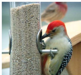
Red-bellied Woodpecker