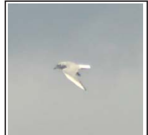
The white leading wing edges ID this as a Bonaparte's Gull

❖ The hikes and programs listed below fill on a first come first serve basis. ❖ PLEASE call the store to register (816) 746-1113