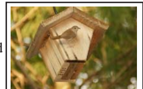
House Wren

To get prepared for the nesting season, we will be talking about Purple Martins, bluebirds and other species that can be attracted to your yard via a nest box. Come with questions and experiences to share with others who take on the role as bird landlords each year.