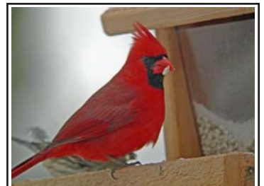
Northern Cardinals love sunflower and safflower seeds.

A. Plain and simple, it really is expectations. The "cheap" birdseed blends are filled with fillers like milo, cracked corn, wheat, sticks, stems, rocks and who knows what else. If he is OK with feeding hordes of House Sparrows, grackle and Mourning Doves then the cheap mixes are probably fine. If he wants to attract cardinals, chickadees, flickers and other beautiful birds then he will do far better with quality seed. A 50lb bag of Black Oil Sunflower (the favorite seed of more birds than any other) is $15.99. I can't imagine a bag of the "cheep" seed costing much less. If he does want to feed the sparrows and doves, he is better just buying a bag of White Proso Millet ($13.99 for 50 lb) and spreading in on the ground and leaving the feeders for the sunflower and better birds. The proof is in the results. Give this a try and see what happens.