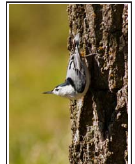
White-breasted Nuthatch

A. This could take a whole page, but in short I think most birds fared very well this summer. I know most of my bluebird people reported 4 successful nestings where they generally are lucky to raise many young ones in the third attempt. Much like last year, there is a bountiful supply of berries and acorns this year and that also bodes well for many birds this winter. On the negative side, I always worry about ground nesting birds like quail and prairie chickens. It is tough for the little ones to survive when it is so wet.