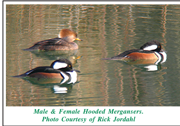
Male & Female Hooded Mergansers.

Both male and female sport distinct crests on the back of their heads. At times of excitement or agitation the males exhibit their full, fan-shaped white crest, bordered in black, so memorable each time it is seen. Females are duller with a bushy brown crest.