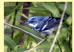
Cerulean Warbler

During year one she recorded 109 species in the study area including several birds that birders long to see each year. Mourning & Prothonotary Warbler, Scarlet & Summer Tanagers, Yellow-crowned Night-Herons and Broad-winged Hawks have all made appearances.