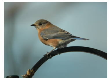
Female Eastern Bluebird

Unipeck Dried Mealworms Pack of 2800 for $9.99