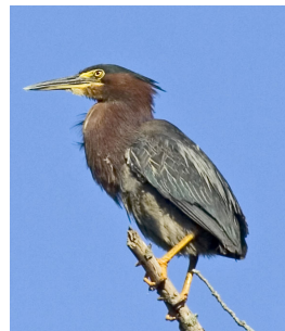
Green Heron