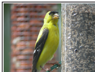
Male American Goldfinch in breeding plumage Photo courtesy of Pat White Nikon P1 Digiscoping Outfit

During the fall and winter months, the mild mannered goldfinch go about their lives in a dull olive grey dress with muted black and white wings. They naturally feed on small seeds of grasses, sunflowers and various other plants, commonly found along weedy field edges and overgrown pastures. At bird feeders they are most famous for eating sunflowers and nyjer seed. While many