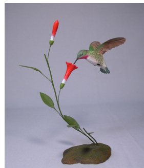
Some of the exciting new products on the way (clockwise): Brass Garden Lizard from Haw Creek Forge, Red-tailed Hawk pin from Bamboo Jewelry, Bluebird socks from Wheelhouse Designs, Birdhouse Tabletop Raingauge by T.M.Hoff, Open-winged Hummingbird hand-carved statue from Birdhug Studios, Emperor's Gong windchime from Woodstock Chimes, the Natural Bird Guardian from Bird Guardian.