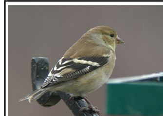
Female American Goldfinch in winter plumage. Photo courtesy of Rick Jordahl Nikon P1 Digiscoping Outfit

still know this seed as thistle, it is not even related to the plant that most dread to see growing