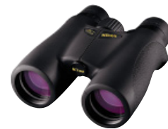
Nikon Premier LX 8X42