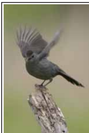
Gray Catbird

He throws his head back and sings a beautiful melodious song borrowing notes from other local birds, rambling on never repeating the same series. Then it dips back down in the brush, continuing its search for food. The only neo-tropic