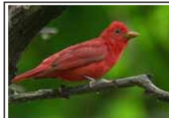
Male Summer Tanager.

Tanagers are among the most colorful birds in the world and we are lucky to have two species that live in our area. The more commonly seen of the two is the Summer Tanager ( Piranga rubra ), found in open woodlands. Adult males are a beautiful all over red bird with a fairly long, thick yellow bill. Females are yellow and young males are often seen in a patchwork plumage