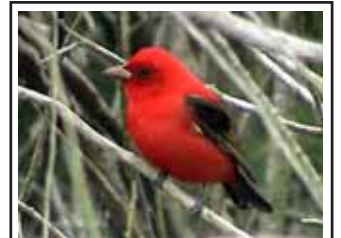
Male Scarlet Tanager.

Scarlet Tanager is not even fair. When you see a