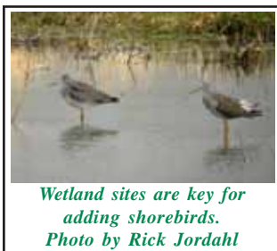
Wetland sites are key for adding shorebirds.

I have said it many times, there is nothing like the feeling of accomplishment that you get when you study an area and its birds, make out a plan and when you get there, you find the birds you where looking for! Big days in your neighborhood, county or region are no different.