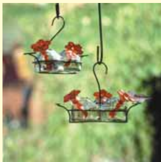
Parasol Hummingbird Feeders are beautiful and practical.

Aside from the old display shelves, racks and cabinets, we will also have many close out specials on discontinued items. Great deals on all.