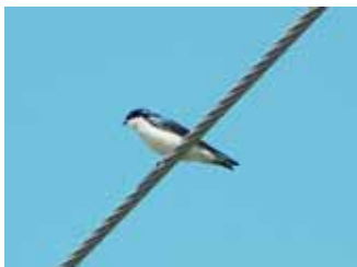
Tree Swallows are beautiful birds that will use bluebird boxes placed in open area.