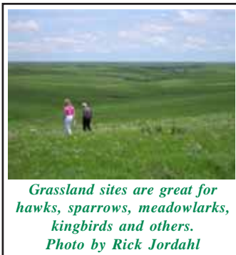
Grassland sites are great for hawks, sparrows, meadowlarks, kingbirds and others.

gros-beaks, buntings, orioles) and an open water area (gulls, terns, ducks, loons, grebes)