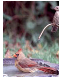
Dripper from Avian Aquatics - $44.99

A dripper does not require electricity, but does require a connection to a water supply. Drippers, as the name implies, provide a steady dripping source of water. We do have one recirculating model that does not require a water source but most do. Some customers are scared off of drippers when we tell them they have to be hooked up to a water source but they really are very simple to operate. They come with a Y-connector that fits on an outside faucet. They also come with 50 feet of hose and a control valve. The amount of water that is “dripping” can be finely adjusted.