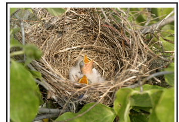
Eastern Kingbird's Nest with Altricial hatchling.