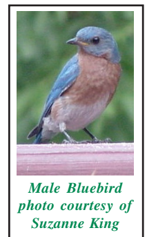
Male Bluebird