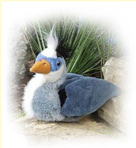
We have a newly restocked supply of Wild Republic singing birds: