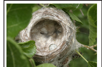
Yellow Warbler's Nest with egg.

Like so many aspects of a bird’s life, eggs and nesting is a fascinating subject. The ultimate goal is to make sure their genes are passed along. You can bet that the size of the eggs, the number of eggs laid, the number of nests per season and all factors are genetically imprinted in birds to ensure success.