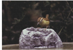
Granite Bubbler from Avian Aquatics - $34.99

Moving water can be provided in several different ways. If you already have a bird bath of some type, the simplest way to get the water moving is by adding either a “bubbler” or a “dripper.” Bubblers do not add fresh water to a system, they simply recirculate the water that you have. Bubblers are generally made to look like a rock and have a pump to pull the water up so that it can cascade down over itself. They do require electricity to operate.