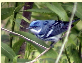
Cerulean Warbler