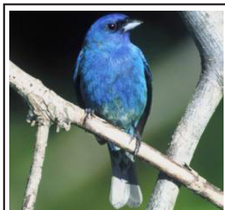
Male Indigo Bunting

Indigo Buntings eat mostly insects, with seeds and fruit for variety. In the spring many of our customers have had them stop at their feeders. Sunflower chips and millet, on the ground or in a feeder, are good seeds for attracting buntings during migration. They usually won't be at your feeders for more than a few days, but while they are, it is breathtaking!!