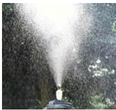
Rock-base Mister by Avian Aquatics - $49.99

Another favorite water mover is the mister . Misters are similar in many ways to drippers but instead of dripping water, it emits a fine spray of water into the air. Misters with a base can be used in a bird bath. Those without bases can be set up to spray into a birdbath or snaked into a bush or tree and allowed to spray into the vegetation. Birds will sit in or fly through the spray or catch water droplets as they fall from the leaves. This is a great way to water plants.