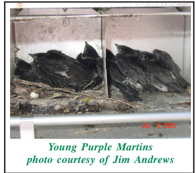
Young Purple Martins

A. There are lots of possible answers to this question, but one that we recently spoke with a customer about was the use of "chemicals" in her yard. She appeared to be doing everything right but did admit that they had a lawn service. She admitted that they treated for grubs and worms to keep the moles out. Bluebirds like most birds require access to lots of insects to raise their hungry young. Resist the use of any pesticides if you want to make your yard truly bird friendly.