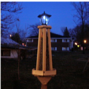
The Lighthouse Feeder from Looker holds 5 quarts of seed and features a solar powered light. $69.99.