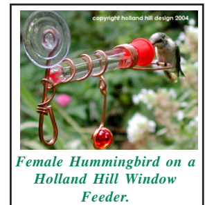
Female Hummingbird on a Holland Hill Window Feeder.