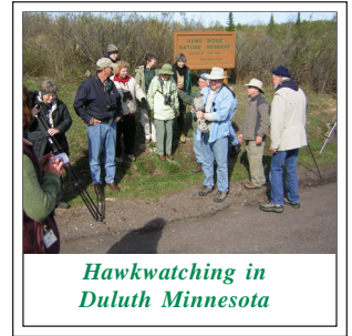
Hawkwatching in Duluth Minnesota

Winter is the time that we schedule the smallest number of outdoor programs for the obvious reasons. This winter we could have been out almost everyday and birded comfortably. The birding was indeed different this year. We had large numbers of robins, bluebirds and raptors all winter, while many ducks just never made it this far south. Our March trip to Smithville Lake was once again the highlight of the season. Five beautiful Common Loons could easily be seen with our spotting scopes, an immature Bald Eagle swooped down and got a fish right in front of us and the Short-eared Owls came out just at sunset.