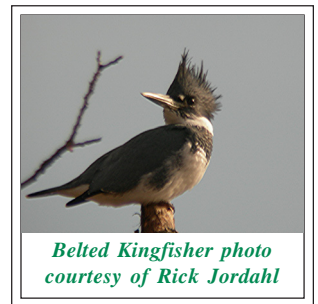
Belted Kingfisher