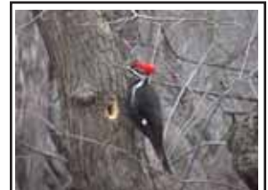
Pileated Woodpeckers are uncommon residents of Kansas City's heavier wooded area.

A. Yes. It is surprising to many to find out that we do have Pileated Woodpeckers in our area. The photo to the right was taken by one of our customers who lives in Parkville near Park University. Pileateds are in and around anywhere there are large enough tracks of timber. I have most often seen them in Swope Park, Burr Oak Wood in Blue Springs, Weston Bend State Park and scattered other site around town. Learn their song, it will help you find them.