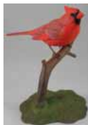
Incredibly accurate, hand-carved wooden statues from Humminbird Studios Cardinal - $124.99