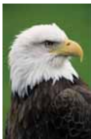
Adult American Bald Eagle

On March 11, 1967, the Bald Eagle ( Haliaeetus leucocephalus ) was placed on the endangered species list in the lower 48 states. Their habitat was being destroyed and they were also shot, trapped, or poisoned. Perhaps most damaging was the effects of the widespread use of the pesticide DDT. Many birds, including eagles could not produce eggs, or if there were eggs, the shells were very thin and the weight of the parent would cause the shell to break. Today the future is much brighter for the Bald Eagle. It has been taken off the endangered list for all but three of the lower 48 states.