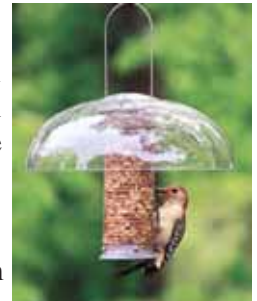
Red-bellied Woodpecker on an Aspects' Peanut Silo ($24.99) with a Tube Top ($14.99)

A. I think the bird in question is a Ruby-crowned Kinglet. They are tiny birds and I like to call them pinballs as they seem to be in constant motion. Kinglets are rather round in shape and khaki colored. Their bold eye ring and wing bars are obvious but their ruby-crown spot is only visible when they are agitated or "flirting."