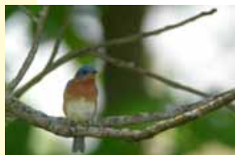
Eastern Bluebird

The Missouri Bluebird Society (MOBS) was founded March 12, 2006, in an effort to enhance the various endeavors, made by groups and individuals across the state, to increase the population of our Eastern bluebird and other native cavity-nesting songbirds.