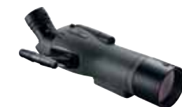
Nikon Waterproof Prostaff 16-48X65mm $499.99

Spotting Scopes are essential for viewing birds at a distance. Hawks, eagles, waterfowl and shorebirds are much more enjoyable when you can zoom up the magnification. Not to mention you can do fun things like see the rings of Saturn this winter.