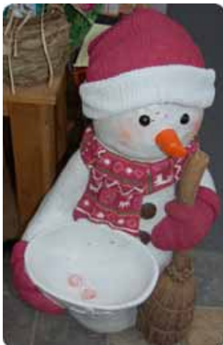
3 Ft Snowman Statue, Feeder ... $139.99