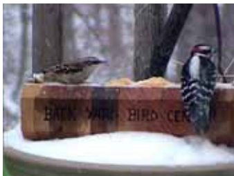
A Brown Creeper and Downy Woodpecker eating peanut butter and cornmeal.

Join us for the 20 th season of Project FeederWatch. Thousands of Citizen Scientists across the U.S. and Canada put out their feeders, count the birds in their yards, and then turn over the data to Cornell scientists each year. You need to be able to count for at least 15 minutes, two consecutive days, and twice a month. If you only want to count once a month or you can't feed birds at your house, consider volunteering at the Martha Lafite Thompson Nature Sanctuary in Liberty (816-781-8598). For more information on Project FeederWatch visit www.birds.cornell.edu/pfw or call 800-843-BIRD (2473). There is a $15.00 fee to pay for materials.