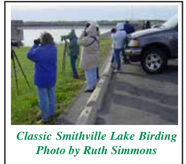
Classic Smithville Lake Birding

After the scorching hot dog days of summer, September and early October provided some surprisingly good bird outings. Both Smithville Lake and Weston Bend State Park shared nice early winter foraging flocks with both kinglets, Blue-headed Vireos, lots of woodpeckers and nuthatches. Perhaps most entertaining was a young male Sharp-shinned Hawk at Weston Bend that chased birds all morning, quite often in plain site. The Blue Jays were not amused. An Osprey and several Cedar Waxwings added to everyone's enjoyment at Smithville Lake.