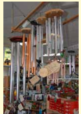
Assorted Handmade Windchimes from JW Stannard. $16.99 to $89.99