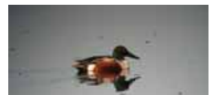
Northern Shovelers are commonly seen on area lakes during the fall.