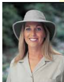
Give the gift of sun protection. Tilley hats are the only hats endorsed by the Mayo Clinic for skin cancer protection. Various styles ranging from $55 - $72 They are guaranteed for life not to wear out.