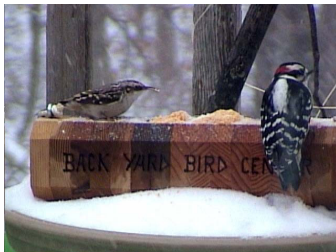
A Brown Creeper and Downy Woodpecker eating peanut butter and cornmeal.