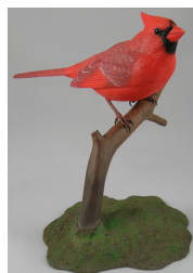
Incredibly accurate, hand-carved wooden statues from Humminbird Studios Cardinal - $124.99