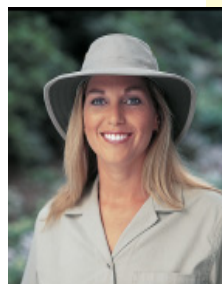
Give the gift of sun protection. Tilley hats are the only hats endorsed by the Mayo Clinic for skin cancer protection. Various styles ranging from $55 - $72 They are guaranteed for life not to wear out.