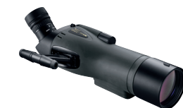
Nikon Waterproof Prostaff 16-48X65mm $499.99

Spotting Scopes are essential for viewing birds at a distance. Hawks, eagles, waterfowl and shorebirds are much more enjoyable when you can zoom up the magnification. Not to mention you can do fun things like see the rings of Saturn this winter.