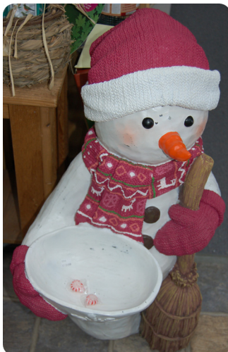
3 Ft Snowman Statue, Feeder ... $139.99