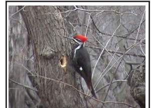
Pileated Woodpeckers are uncommon residents of Kansas City's heavier wooded area.

A. Yes. It is surprising to many to find out that we do have Pileated Woodpeckers in our area. The photo to the right was taken by one of our customers who lives in Parkville near Park University. Pileateds are in and around anywhere there are large enough tracks of timber. I have most often seen them in Swope Park, Burr Oak Wood in Blue Springs, Weston Bend State Park and scattered other site around town. Learn their song, it will help you find them.