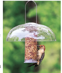
Red-bellied Woodpecker on an Aspects' Peanut Silo ($24.99) with a Tube Top ($14.99)

A. I think the bird in question is a Ruby-crowned Kinglet. They are tiny birds and I like to call them pinballs as they seem to be in constant motion. Kinglets are rather round in shape and khaki colored. Their bold eye ring and wing bars are obvious but their ruby-crown spot is only visible when they are agitated or "flirting."