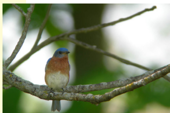
Eastern Bluebird

Some of our customers have become members, so you may see some familiar faces at the meetings.