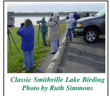
Classic Smithville Lake Birding

After the scorching hot dog days of summer, September and early October provided some surprisingly good bird outings. Both Smithville Lake and Weston Bend State Park shared nice early winter foraging flocks with both kinglets, Blue-headed Vireos, lots of woodpeckers and nuthatches. Perhaps most entertaining was a young male Sharp-shinned Hawk at Weston Bend that chased birds all morning, quite often in plain site. The Blue Jays were not amused. An Osprey and several Cedar Waxwings added to everyone's enjoyment at Smithville Lake.