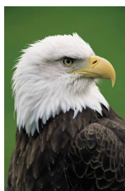
Adult American Bald Eagle

Adult Bald eagles are easy to recognize with their pure white head, neck, and tail and big yellow hooked bill. Did you know that the word bald comes from an old English word for white? Males and females look alike, but the females are larger! Males are about 8-9 lbs and the females are 10-14lbs. Both are about three foot tall with a seven foot wingspan. Pairs use the same nest year after