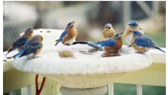
A winter flock of Eastern Bluebirds at Missouri birdbath equipped with a de-icer

No its not too late to get a de-icer for this winter season!