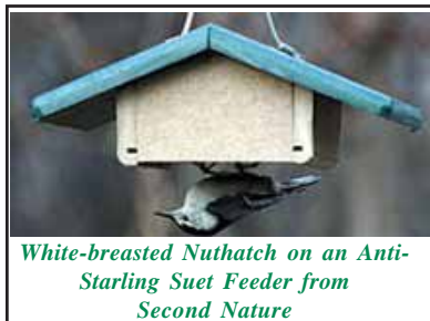
White-breasted Nuthatch on an Anti-Starling Suet Feeder from Second Nature

He offers food to his mate as an act of pair bonding. Spring is coming and courting begins again. Last year he dropped chunks of bark into the knot hole to prepare the nest cavity. Ant bodies were smeared all around the entrance. This helps to make the nest hole less appealing to squirrels in search of their own nest cavity. Who wants to live with ants climbing all over the place? Grasses, rootlets