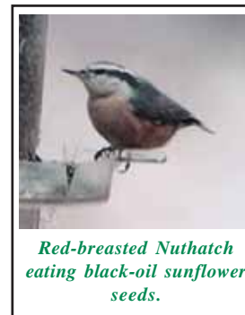
Red-breasted Nuthatch eating black-oil sunflower seeds.

out of Canada and northern United States in years of poor pine seed production. Their slimmer bills work great for extracting seeds from pinecones while their larger, white-breasted cousin uses its heavier bill to crack seeds and nuts, thus the name Nuthatch.