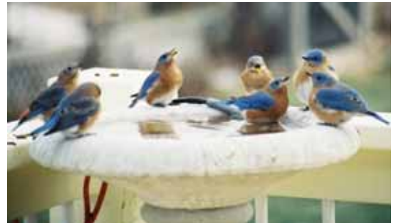
A winter flock of Eastern Bluebirds at Missouri birdbath equipped with a de-icer

No its not too late to get a de-icer for this winter season!