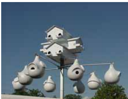
We now have the highly acclaimed Lone Star Purple Martin Houses in stock!