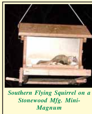
Southern Flying Squirrel on a Stonewood Mfg. Mini-Magnum