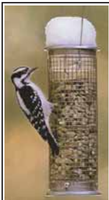
Downy Woodpecker using his kickstand on an Aspect Peanut Silo