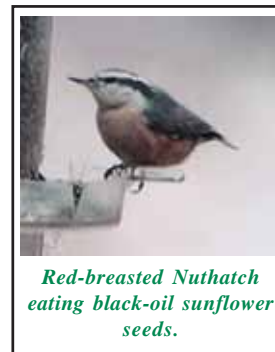
Red-breasted Nuthatch eating black-oil sunflower seeds.

Recently a customer called about a smaller nuthatch with a black eye stripe and reddish breast. Could this be the female? What she described was a Red-breasted Nuthatch. Not present every winter, red-breasteds will wander out of Canada and northern United States in years of poor pine seed production. Their slimmer bills work great for extracting seeds from pinecones while their larger, white-breasted cousin uses its heavier bill to crack seeds and nuts, thus the name Nuthatch.