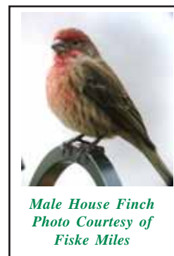
Male House Finch