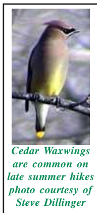
Cedar Waxwings are common on late summer hikes

Meet at the store at 7:30 or at the Park Gate at 8:00.