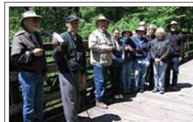
A Wonderful Day of Birding at Watkin's Mill State Park

After having two subpar birding springs in a row, we were due to have a good one. For those who joined us on some of our spring outings, you know that we had a very good migration season. The birds at Weston Bend and Watkin's Mill were exceptional. Though rain shortened, Weston produced 61 species (14 different warblers) and Watkin's Mill greeted us with perfect weather, 71 species (17 different warblers) and stunning looks at Bay-breasted Warbler, Philadelphia Vireo and two very close Scarlet Tanagers. As always, spring re-energizes us as birders and reminds us of why we love this hobby so much.