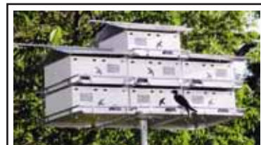
Coates WatersEdge 14 Martin Box

A. You would not get any nesting activity this late, but many theorize that as martins gather to migrate south in the fall, they are scouting out potential nesting sites for next year. If you do, be careful to keep sparrows from setting up nest.