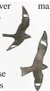
Common Nighthawks from The Sibley Guide to Birds from Knopf Press

On your next evening run to the grocery store, listen for the "peent" and then watch the skies for the hawk that's not really a hawk!