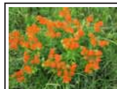
Butterfly Weed is a beautiful native wildflower

Meet at the store at 2:00 or call for directions.