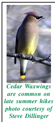
Cedar Waxwings are common on late summer hikes

Meet at the store at 7:30 or at the Park Gate at 8:00.