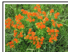
Butterfly Weed is a beautiful native wildflower

Meet at the store at 2:00 or call for directions.