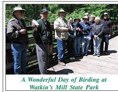
A Wonderful Day of Birding at Watkin's Mill State Park

After having two subpar birding springs in a row, we were due to have a good one. For those who joined us on some of our spring outings, you know that we had a very good migration season. The birds at Weston Bend and Watkin's Mill were exceptional. Though rain shortened, Weston produced 61 species (14 different warblers) and Watkin's Mill greeted us with perfect weather, 71 species (17 different warblers) and stunning looks at Bay-breasted Warbler, Philadelphia Vireo and two very close Scarlet Tanagers. As always, spring re-energizes us as birders and reminds us of why we love this hobby so much.