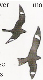
Common Nighthawks from The Sibley Guide to Birds from Knopf Press

On your next evening run to the grocery store, listen for the "peent" and then watch the skies for the hawk that's not really a hawk!