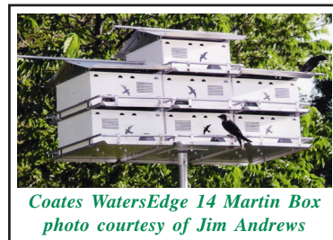
Coates WatersEdge 14 Martin Box

A. You would not get any nesting activity this late, but many theorize that as martins gather to migrate south in the fall, they are scouting out potential nesting sites for next year. If you do, be careful to keep sparrows from setting up nest.