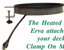
The Heated BAIH from Erva attaches easily to your deck railing. Clamp On Mount $54.99 Screw On Mount $51.99 Ground Level $54.99