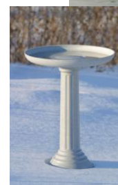
The Heated Kozy Bird Spa is made of tough impact plastic. It cleans up easily and has a 3 year warranty. Deck Mount $89.99 With Pedestal $124.99 Pedestal only $39.99