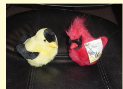
Wild Republic Singing Birds.-$6.99