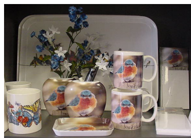
Mad Bluebird Mugs, trays, vase, flags, memo pads and more - various