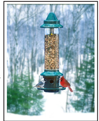
The Squirrel Buster Plus has quickly become a best seller in our squirrel-proof line. $64.99

A. Foiling squirrels continues to be at the forefront of feeder design. I still feel the best way is a well positioned pole system with a quality baffle. It does seem that the issue of too many trees to prevent the air attack is becoming more common. If that is your case then you should consider a squirrel proof feeder. While we have several good models, the Squirrel Buster Plus from Brome (see picture) has become one of our best sellers.