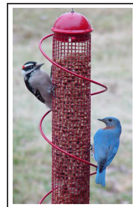
A Downy Woodpecker and Eastern Bluebird take advantage of the high oil content in peanuts on the NEW BirdQuest Spiral Peanut Feeder - $29.99

3) Peanuts – no one should be surprised that birds or almost any animal would love peanuts. They are high in oil and fat and convert easily to body heat. Even though it can drive up the cost, most good mixes have some nuts. It is far more economical to feed raw shelled peanuts via wire mesh peanut