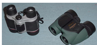
Great Starter Binoculars PowerView 4X20