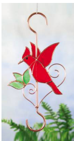
Gallery Stained Glass Hook.- $14.99