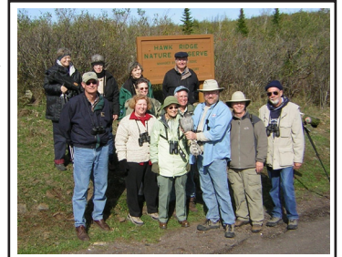
Minnesota Hawk Watching group with our adopted friend, a female Northern Goshawk

The summer birding season was terrific. It started with a very good migration season that extended into a mild nesting season. During the late summer hikes we had good fall warbler movement as well as great looks at Yellow-billed Cuckoos and numerous Indigo Buntings. The highlight of the season for me, was our trip to Duluth, Minnesota. The terrific weather and brilliant fall color topped off a great birding weekend. The definite stars were the raptors. Hawk Ridge Sanctuary is a true “Hot Spot” for birding in the fall. This marked the first time in my life that I was able to watch a Golden Eagle and a Bald Eagle soaring together. What a chance of a lifetime to study the flight profiles of those magnificent birds. Then there were the hundreds of Sharp-shinned Hawks, four Northern Goshawks, numerous Merlins, a gorgeous dark phased Rough-legged Hawk among the many Red-tailed Hawks and American Kestrels. Wow! What an experience.