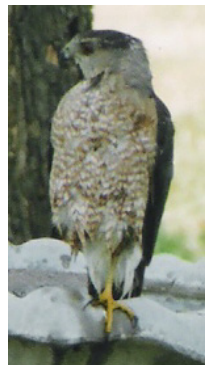
Cooper's Hawk