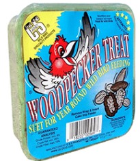
Woodpecker Treat from C&S is high quality suet. -$2.29

A. There are a couple of big differences in suet. First is the difference between summer and winter formulas. The no melt formulas for summer are doughier and have less fat in them. The other difference is (as always) quality. Cheap suet cakes are generally filled with "fillers", usually a cheap bag of bird seed. The birds that feed on suet cakes do it for the suet, not the millet seed in the cake. Better suet cakes cost a little more but contain only the basic ingredients that the birds want. My choices for the best winter cakes #1 Pure Suets, #2 Woodpecker Treat & #3 Peanut Treat.