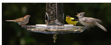
Aspects’ New Fancy Swirl-Tray $13.49

OK. Let’s go over all of this. Black Oil Sunflower is the best overall seed but to attract a diverse mix of birds, a variety of clean, high quality seed is best. Less dirt and grains, more quality seeds equal a greater value to you and your birds.