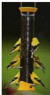
Goldfinches on the Droll Yankee 15” Finch $24.99

5) Nyjer – also erroneously known as thistle. Nyjer is a specialty seed that is a favorite of the beloved goldfinch. A few other birds like it but for the most part, a feeder filled with nyjer is for the finches. It is grown in far away lands and sterilized before being imported.