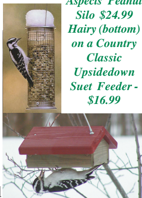
Downy (top) on Aspects' Peanut Silo $24.99 Hairy (bottom) on a Country Classic Upsidedown Suet Feeder - $16.99

When you see the birds together on the same feeder or tree, it looks as if the Hairy is the parent and the