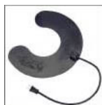
Kozy Bird Spa Crescent Shaped De-Icers fit around statuary pieces. $54.99