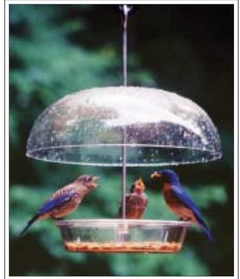
- Aspect Vista Dome - Works great for teenagers learning to eat mealworms.

The teenage years can be a tough time for everyone. The name of the game is survival. Don't worry about the shaggy hair, learn to eat the right foods and, for goodness sakes, be careful behind the "wheel" and we can all survive the "teenage" period.