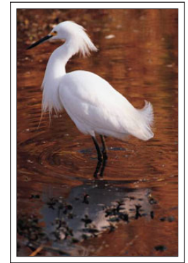
Some birds, like the snowy egret, grow decorative plum feathers during the mating season.

Singing, dancing, sharp clothes – it does kind of sound like the making of a good movie. Choosing the right "mate" is incredibly important for birds as well as any animal. Your goal is to survive and perpetuate the species. The wrong choice doesn't mean marriage counseling or divorce court, it often is life or death.