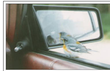
Here is proof that robins and cardinals are not the only birds who try to chase away their reflection. This Northern Parula (warbler) was attacking the side mirror of our rental car in Maine several years ago.

A. Simply stated, he is in love. For as smart as birds are, there are two things they do not know – one is their own voice and the other is their own reflection. The bird is seeing his own reflection and is trying to chase the rival bird out of his territory. Both male and female birds do this with the more famous species being cardinals, robins and mockingbirds but it is a behavior documented in many others. I have pictures of a Northern Parula (warbler) on our car side mirror, determined to get rid of his rival. My favorite stories are those of roadrunners and quail banging away at people's hubcaps. The good news is that it generally only lasts for a short while. The bad news is that, short of covering your windows from the outside with screen or even paper, there is little that can be done. The birds rarely hurt themselves.