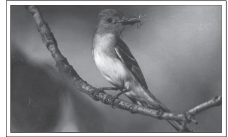
Great Crested Flycatchers have been known to eat larger prey items such as dragonflies, hummingbirds, and small lizards.

Being a woodland species, it may not surprise you that GCFLs nest in cavities like bluebirds and woodpeckers. And just like bluebirds and woodpeckers, you can entice Great Cresteds to nest in your yard by putting up a nest box (and yes, we do carry a GCFL box at the store!). Mom builds the nest by herself and probably sits on the eggs by herself as well. Males do develop a "brood patch" which is a bare patch below the breast for maximum heat transfer to the eggs, but we don't know if the males ever incubate or brood. It seems to be up to mom to care for the nest. Another interesting nesting habit is that this species is noted for placing snakeskins in their nests.